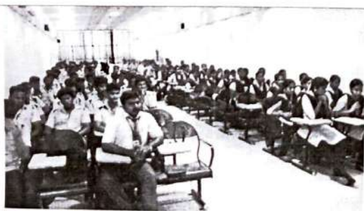
The positive reception of the audience