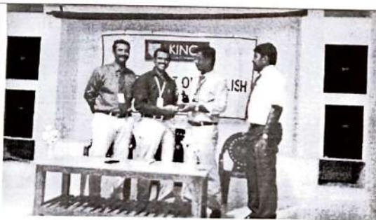
The Resource Person is being honoured with a memento