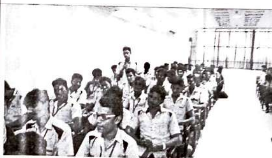
Feedback by the students